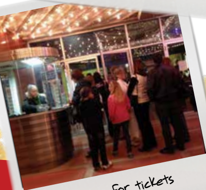
Guests line up for tickets