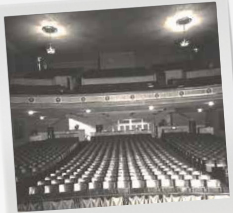
A view from stage early 1920s

RTR was established in 2009 by a group of Shelby County citizens who, along with local arts groups, recognized the importance of the Historic Sidney Theatre to the community. RTR announced the Capital Campaign for the restoration, preservation and utilization of the Historic Sidney Theatre in September 2012 with a lead gift of $300,000 from Emerson Climate Technologies. Nearly $1,500,000 has been pledged to date.