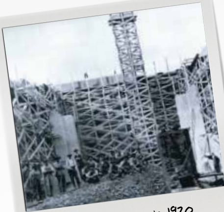
Construction begins in 1920

In the mid 1970s the Chakeres Theatre Co. renovated the theatre as a triplex movie house and provided entertainment to our community until it closed in 2004.